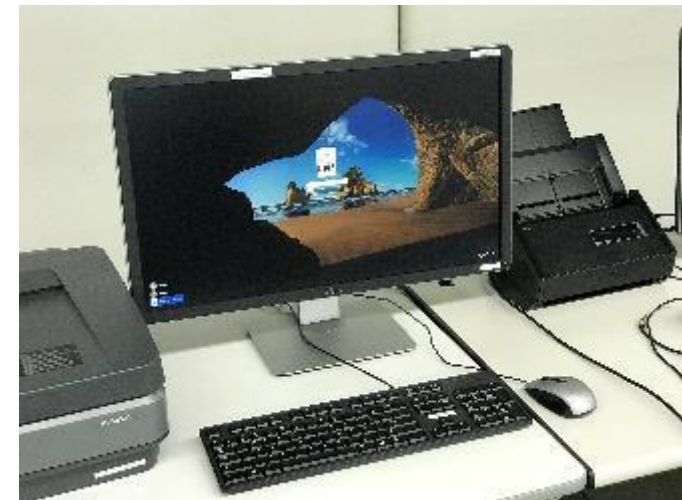
Windows PC at 2F/3F Loft