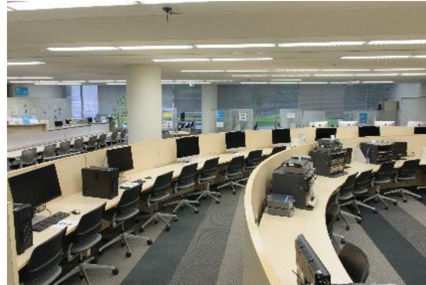
General Purpose Mac/Windows at Media Center