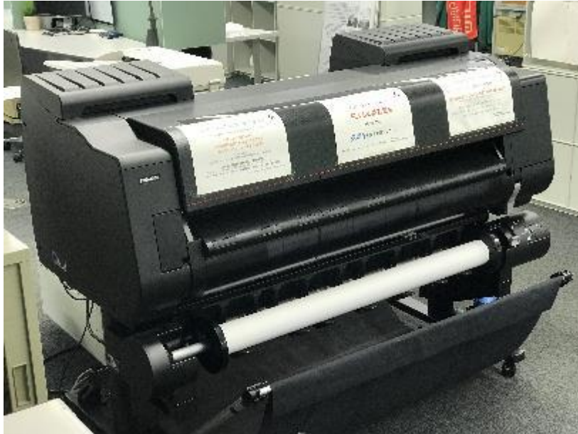
Large Format Printer at 3F Loft

For more information on the use of large format printers https://www.mag.keio.ac.jp/en/users-guide/shared-facilities/printers/lfp/