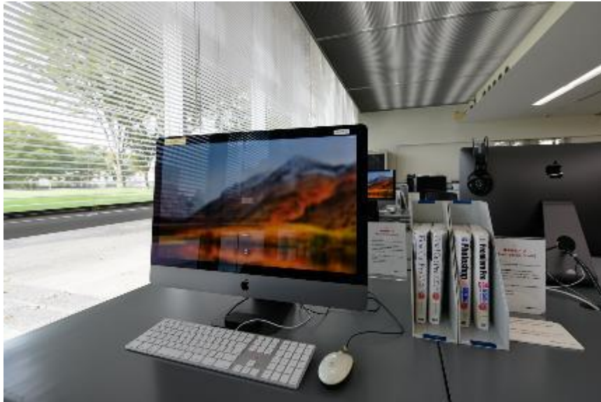
Specialized Mac for Movies at Media Center