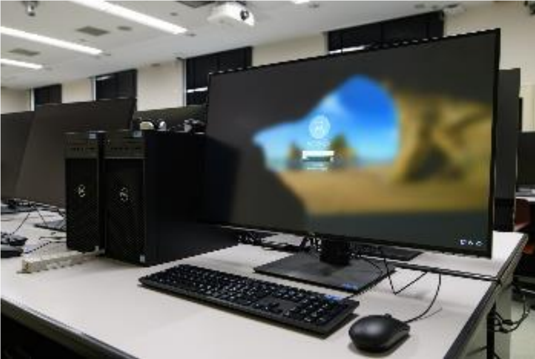
λ11 PC room