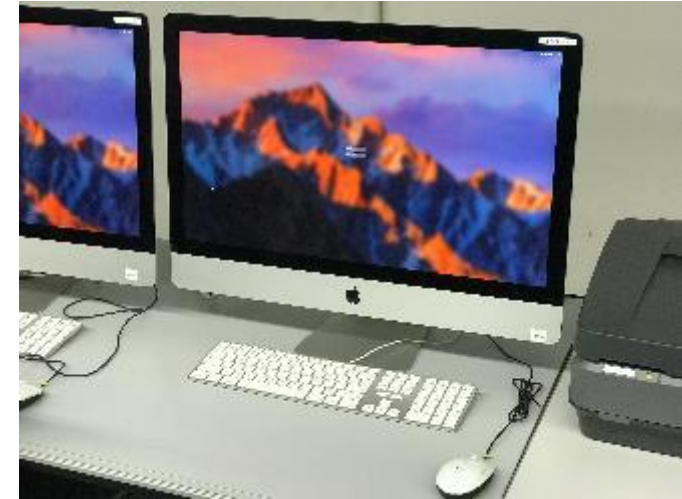
Macs at 2F/3F Loft

2F/3F Loft at Tau Bldg. are a research space for graduate students of the GSMG.