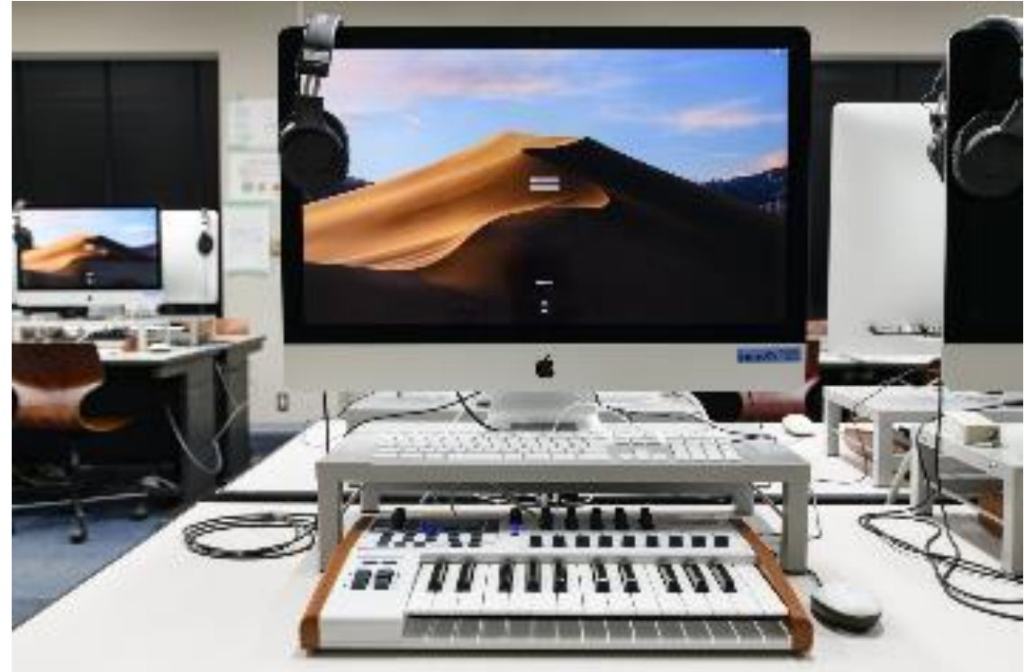
λ21 PC room