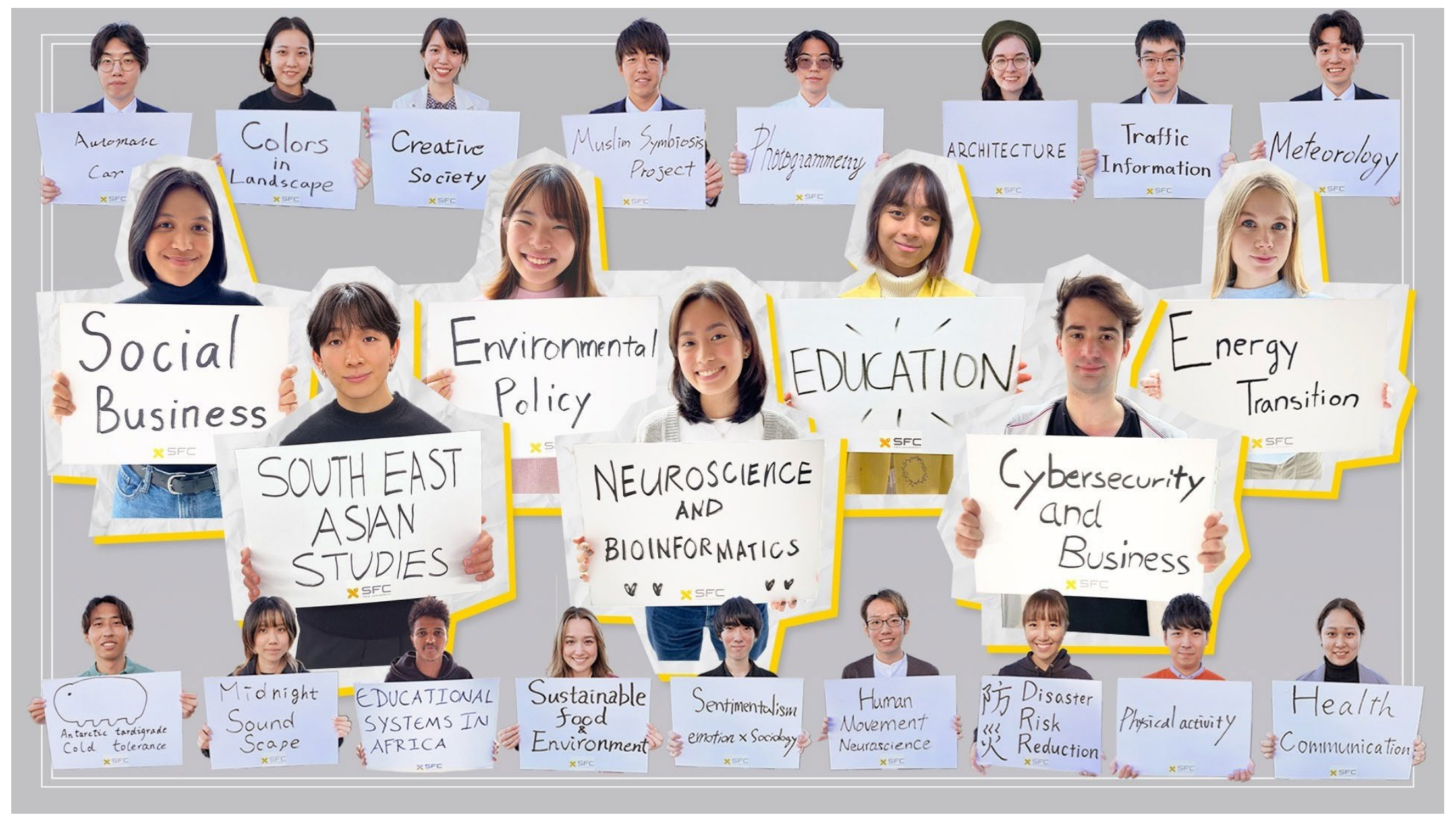
Click here to explore our new interactive video!