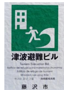
Sign of Tsunami Evacuation buildings

http://bosaiinfo.city.fujisawa.kanagawa.jp/pdf/tsunami_kouiki.pdf