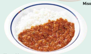
Vegetable curry (vegan)