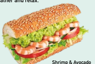
Shrimp & Avocado