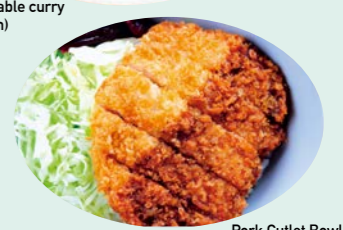
Pork Cutlet Bowl